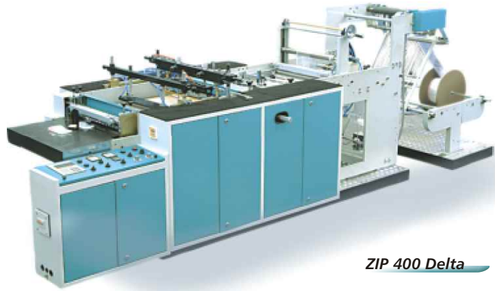
ZIP 400 Delta